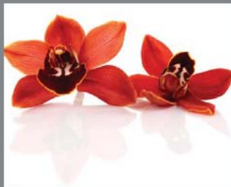
Bianco "High-Gloss" / "High-Gloss" white