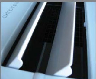
Flap automatizzati Auto opening flaps