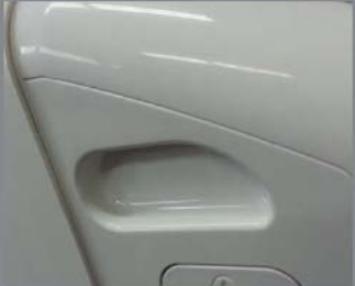
Useful side handles Pratiche maniglie laterali