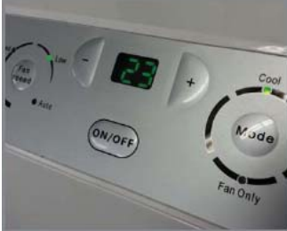
Pannello comandi digitale con display a LED Digital control panel with LED display