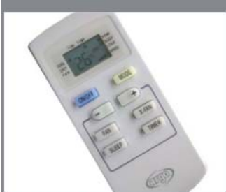
Telecomando digitale Digital remote control