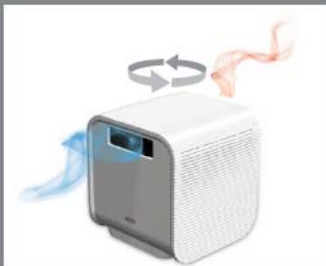
Ruotandolo di 180° passa da freddo a caldo Turn it 180° to switch from cooling to heating