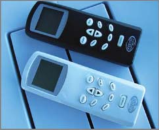
Telecomando in tinta Colour matched remote control