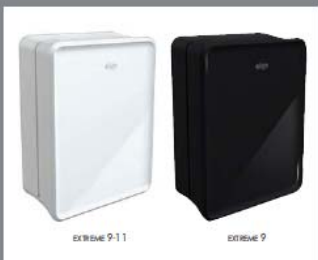
Bianco puro o nero totale Pure white or total black