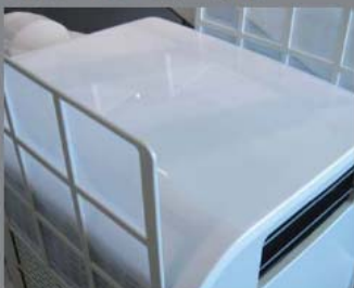
Filtro aria sui due lati, semplice da rimuovere Air filter on both sides, easy to be moved