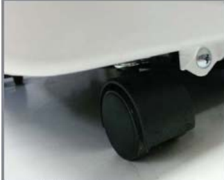
Ruote pluridirezionali Multidirectional wheels