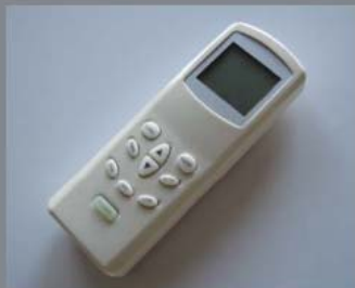
Telecomando digitale Digital remote control