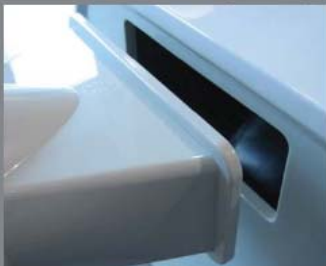
Connessione tubo con magneti Hose connection trough magnets