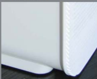
Ruote a semi-scomparsa Semi-concealed wheels