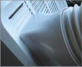
Speciale sistema a magneti per una facile connessione del tubo Special magnet system for an easy hose connection