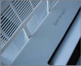
Filtri aria facilmente estraibili Easy removable air filters