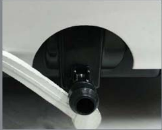
Foro per lo scarico della condensa Condensate drain hole