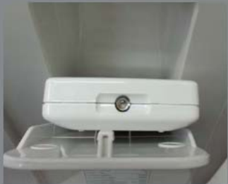
Comodo vano riponi-telecomando Useful compartment stow-remote control